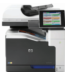
HP LaserJet Enterprise 700 color MFP M775dn