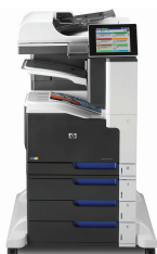
HP LaserJet Enterprise 700 color MFP M775z