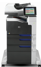
HP LaserJet Enterprise 700 color MFP M775f