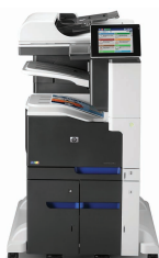
HP LaserJet Enterprise 700 color MFP M775z+