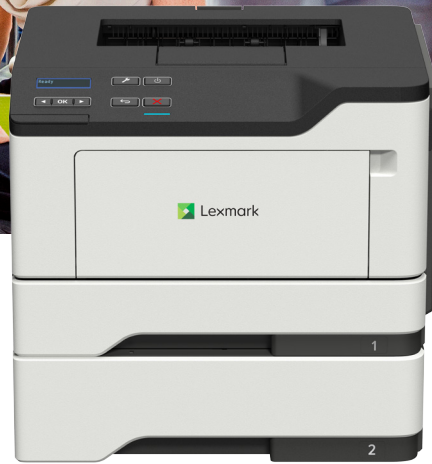
B2442dw with optional tray